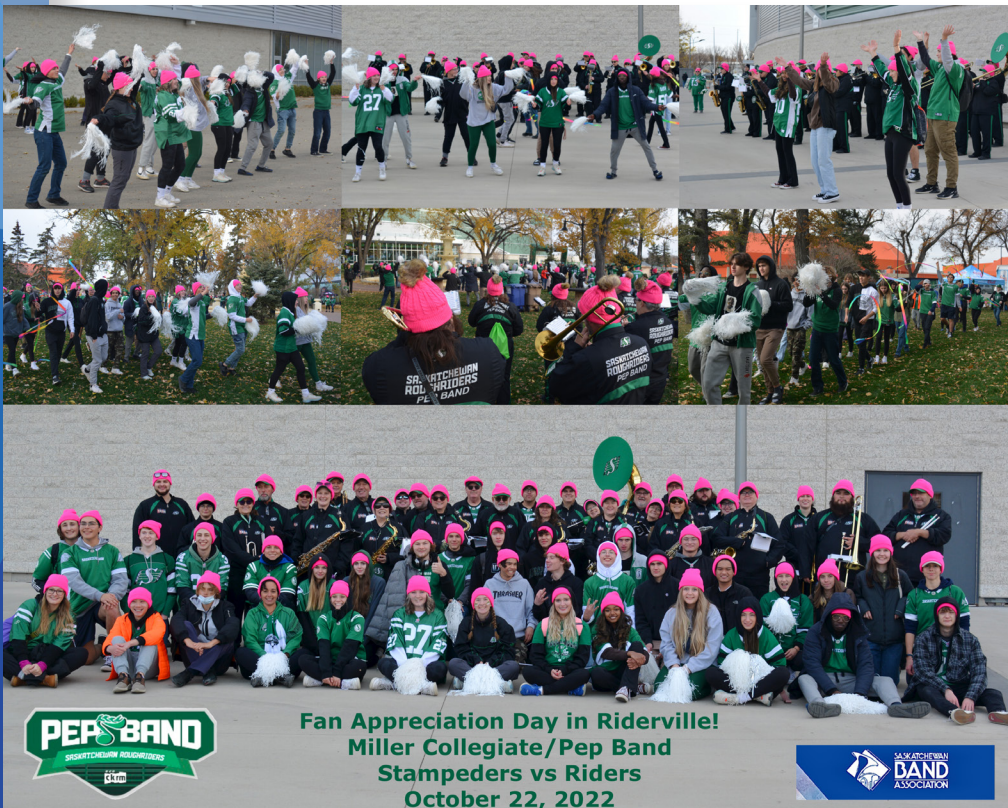
Fan Appreciation Day in Riderville! Miller Collegiate/Pep Band Stampeders vs Riders October 22, 2022